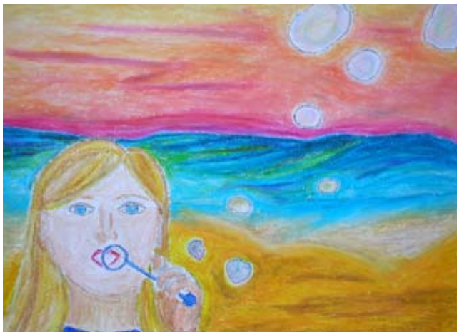
Figure 2 : “Clearing a Space” by Nicole

Nicole, describes the painting (Figure 2) that came out of her experience of doing the Clearing a Space exercise: