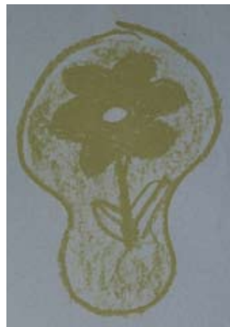
Figure 7: Lisa, Peaceful Place

After imagining the issue resolved, Lisa's felt-sense image is transformed into a soft, strong yellow flower with a smooth, figure eight shape around it (Figure 7). Lisa shares, "I felt the tension in my stomach relax and change to peace."